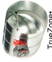
TrueZone Bypass Damper