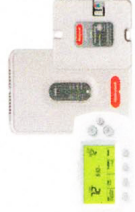
Wireless Zoning System