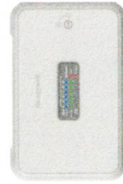
New! Hydronic Zoning Panels