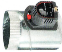
ARD Round Zone Damper